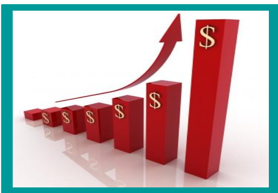
Cost of Stress to American Businesses

*according to the World Health Organization